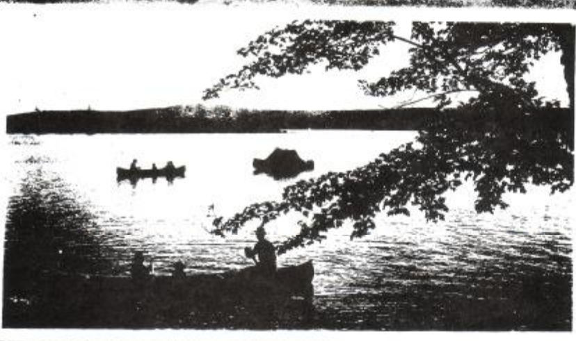
VIEW FROM DARLING CAMP