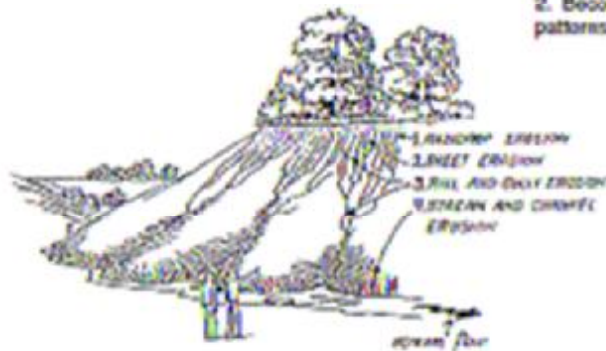
TYPES OF EROSION

REMEMBER! Your property may be only one small part of the big picture but collectively, with other homes, it can represent a significant source of nutrient pollution and soil erosion.